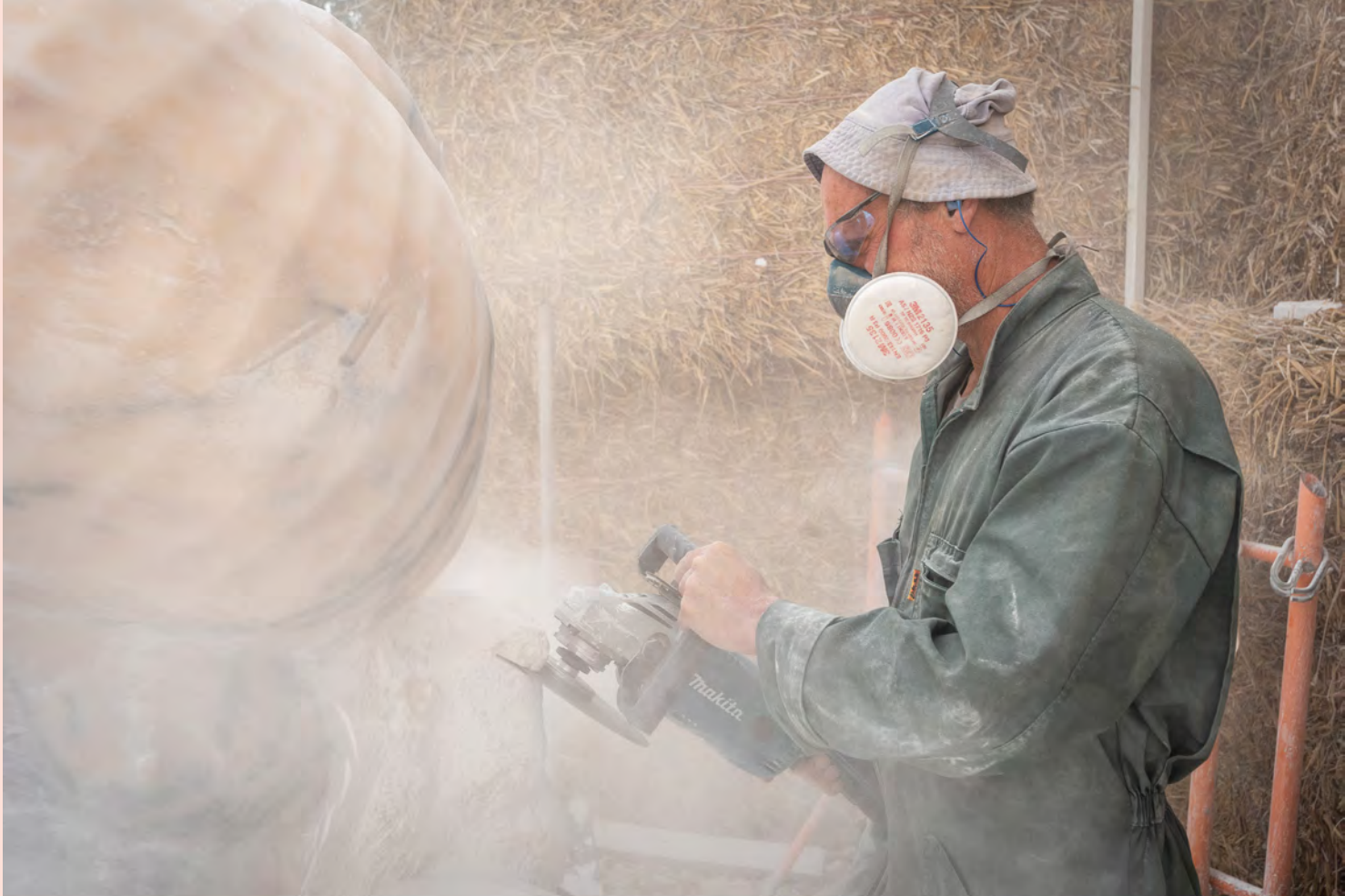
Studio views, Brittany, France, 2025