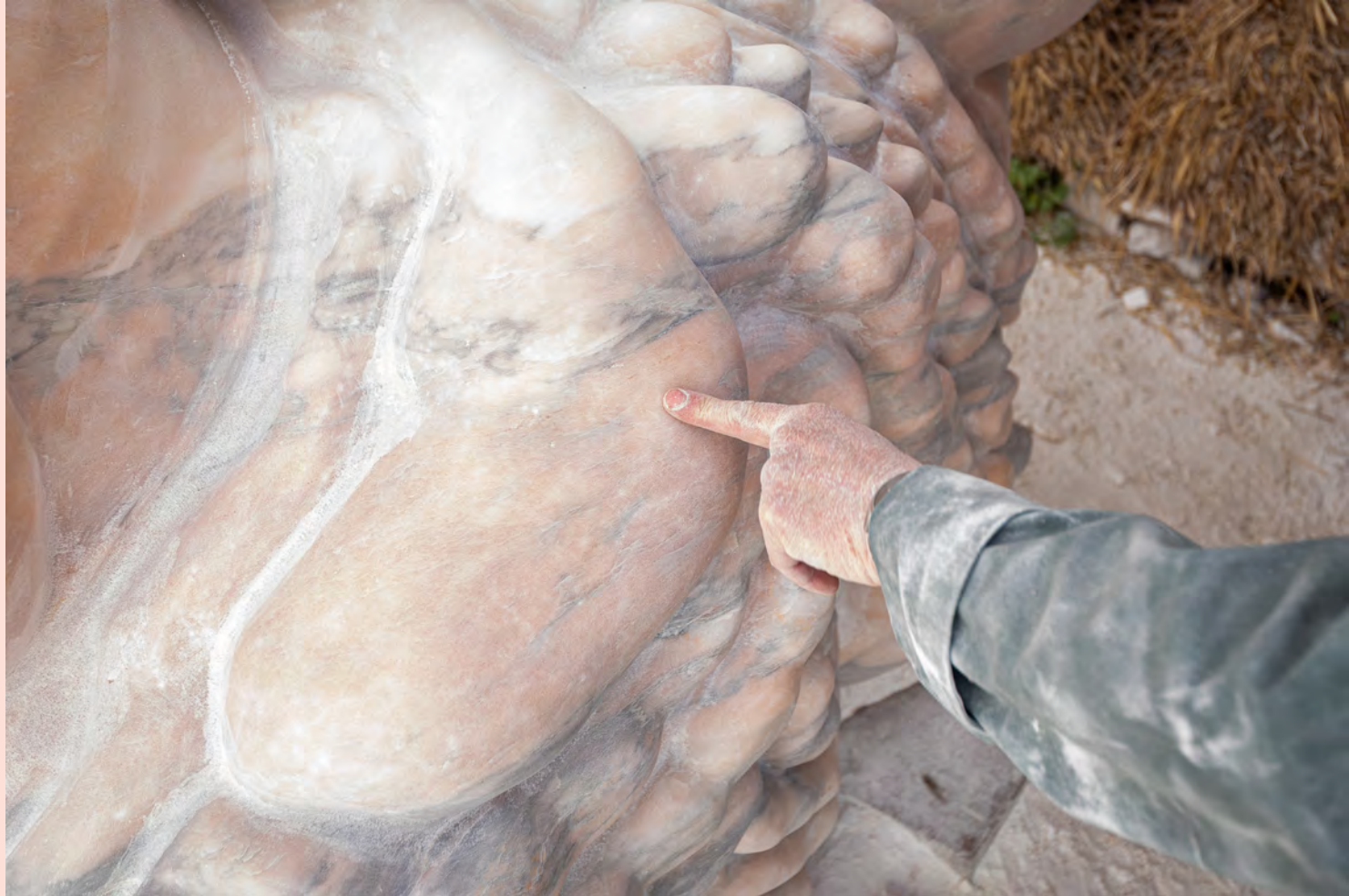
Studio view, Brittany, France, 2025