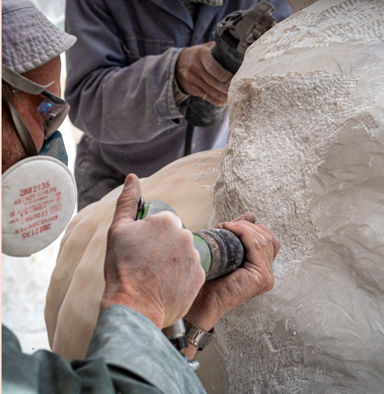
Studio view, Brittany, France, 2025