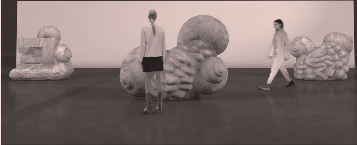
Simulation of the on-site installation