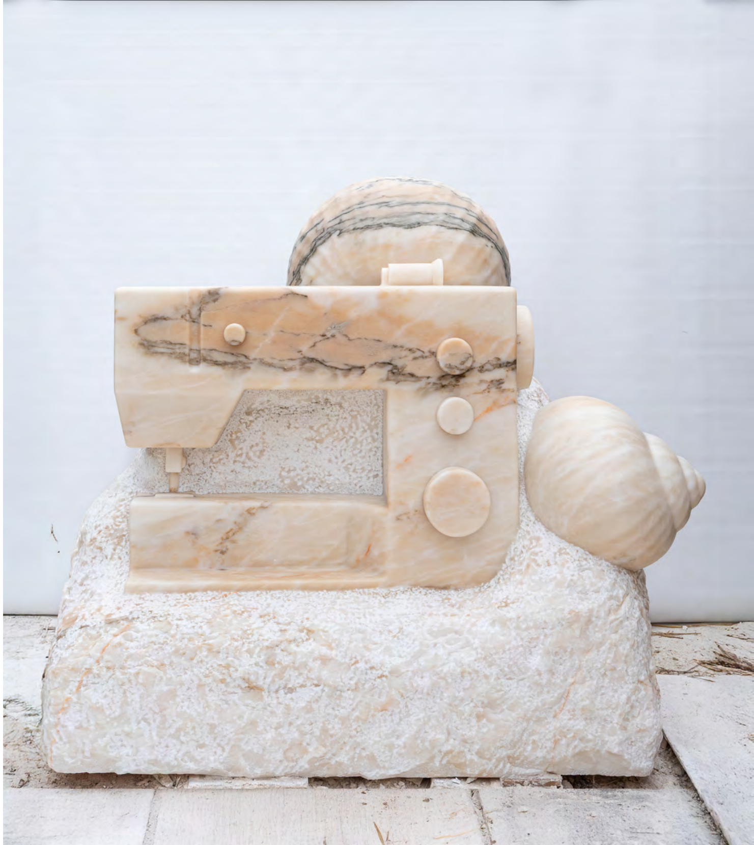
Marble sculpture with sewing machine and snails

Daniel Dewar & Grégory Gicquel 2025 Rosa Aurora marble 160 × 180 × 110 cm