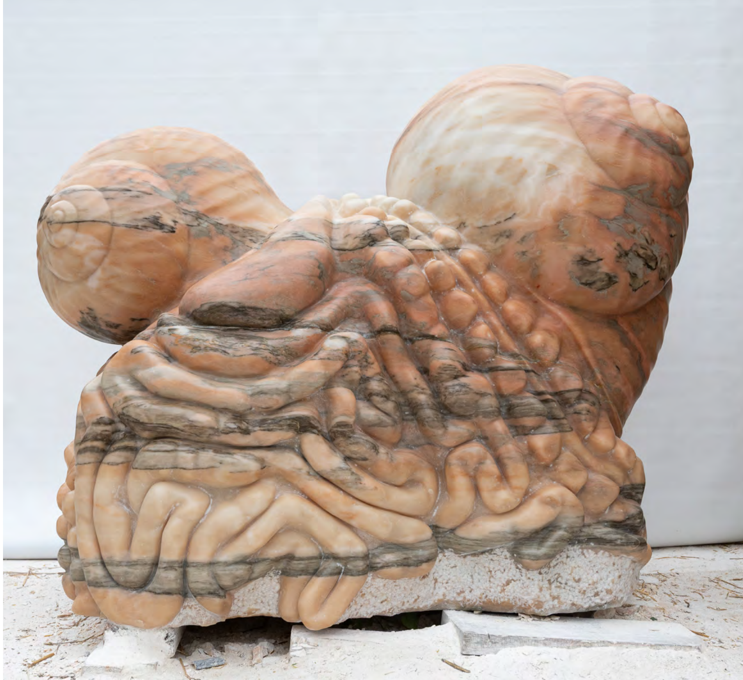
Marble sculpture with organs and snails

Daniel Dewar & Grégory Gicquel 2025 Rosa Aurora marble 140 x 180 x 110 cm