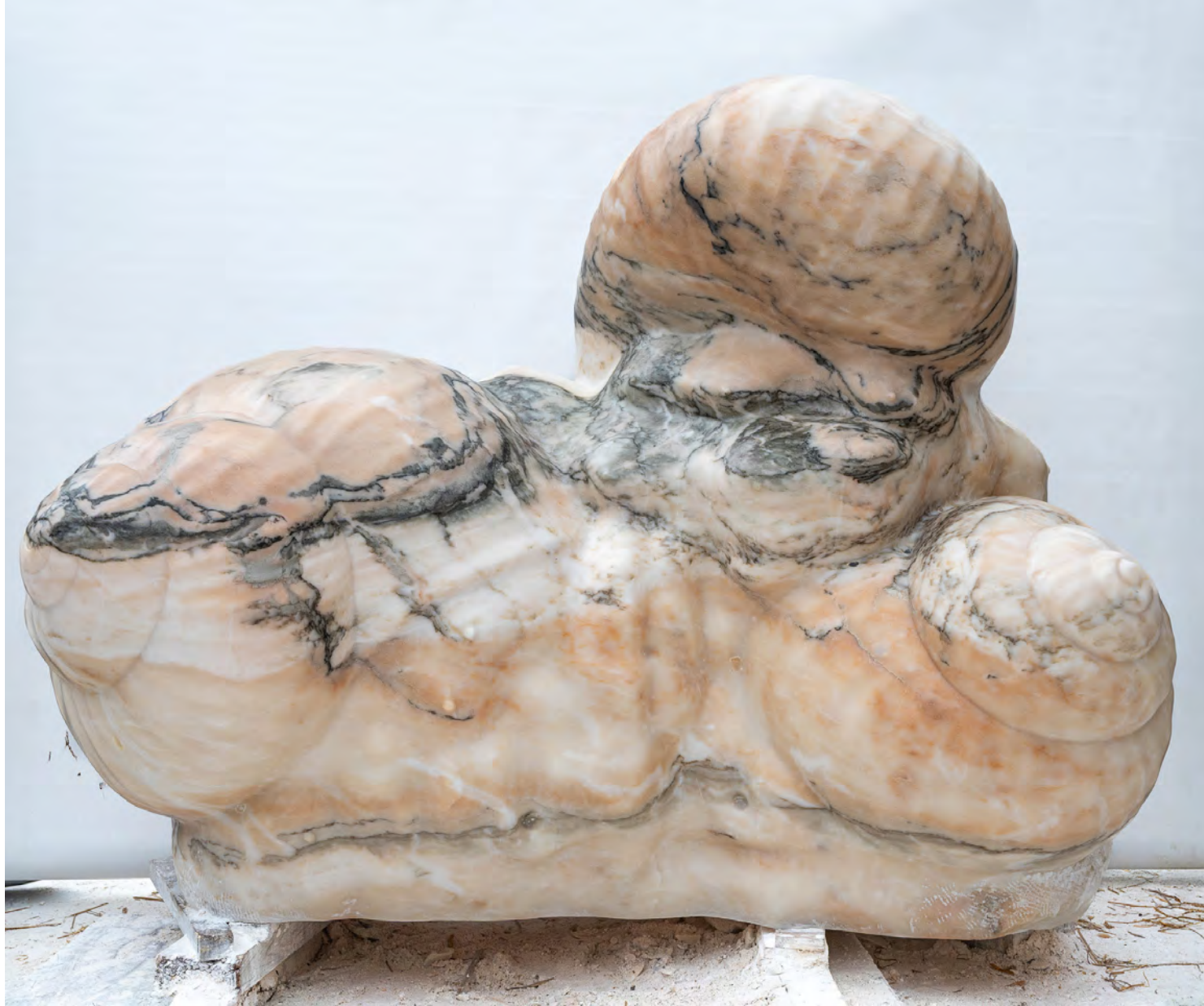
Marble sculpture with body fragments and snails

Daniel Dewar & Grégory Gicquel 2025 Rosa Aurora marble 160 x 210 x 110 cm