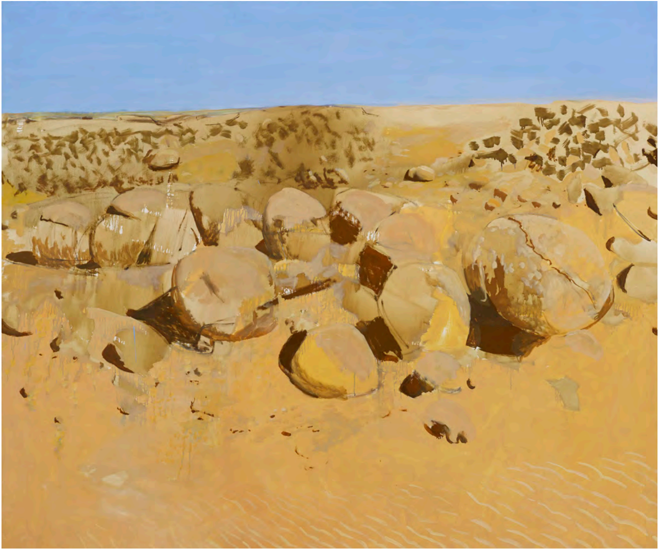
Gilles Aillaud Désert , 1987 Oil on canvas 66 1/8 x 78 3/4 inches (168 x 200 cm.) (AO 0706)