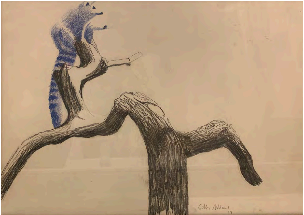
Gilles Aillaud Lémurien , 1968 Pencil on paper 16 1/2 x 22 inches (41.8 x 55.8 cm.) (AO 0709)