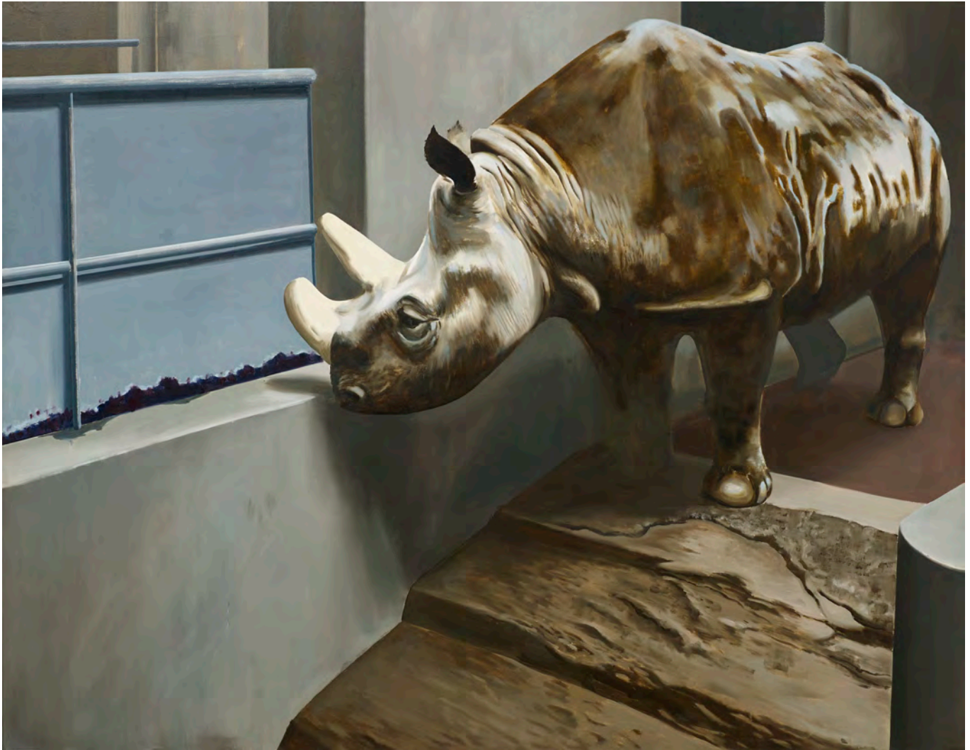
Gilles Aillaud Rhinocéros , 1972 Oil on canvas 76 3/4 x 98 3/8 inches (195 x 250 cm.) (AO 0702)