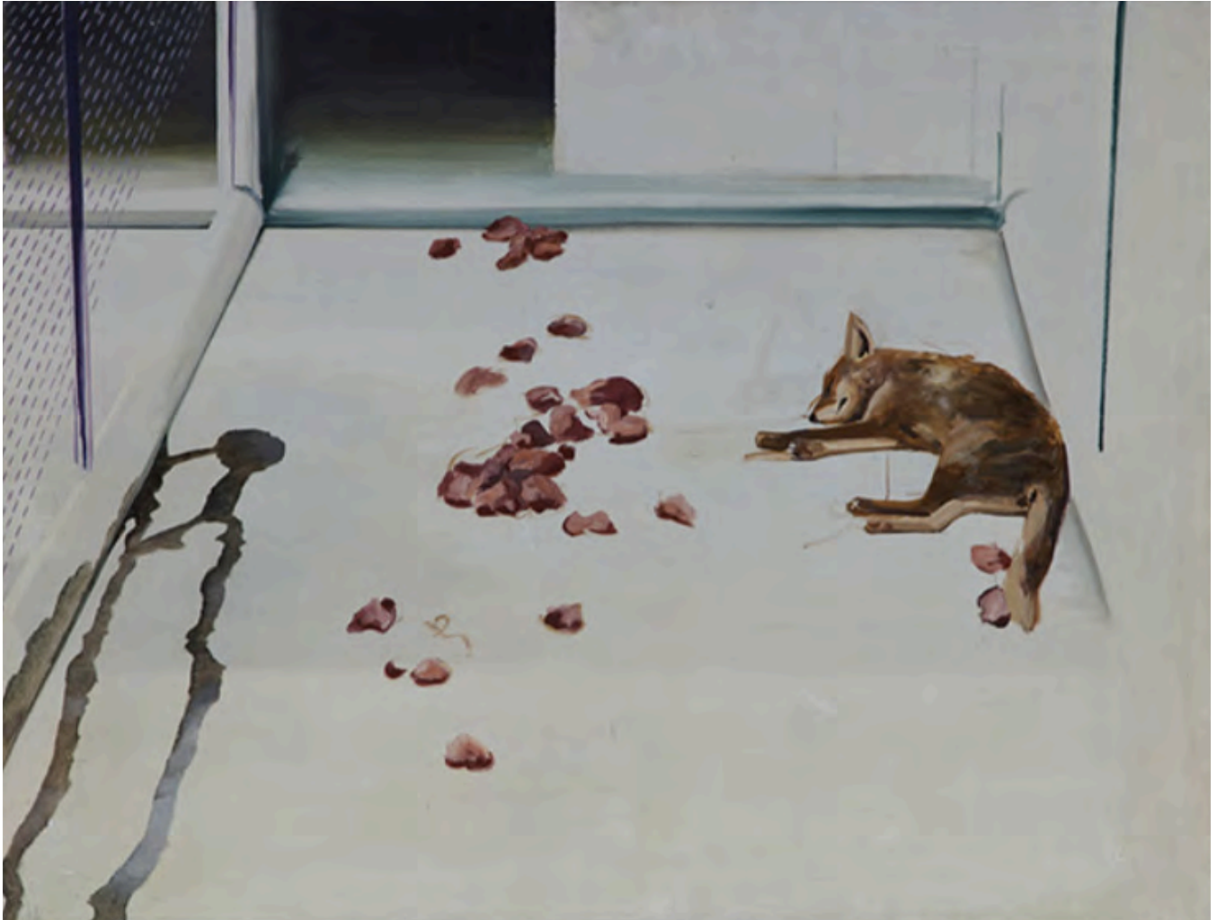
Gilles Aillaud Renard mort de viande , 1966 Oil on canvas 35 1/8 x 45 5/8 inches (89 x 116 cm.) Signed and dated (AO 0707)