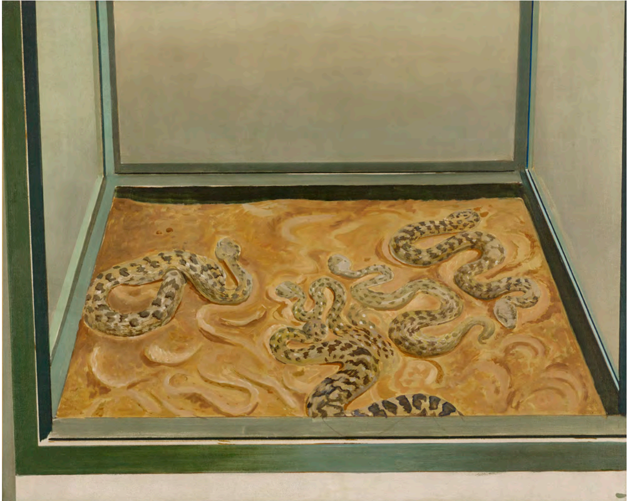
Gilles Aillaud Boite de serpents , 1967 Oil on canvas 31 7/8 x 39 3/8 inches (81 x 100 cm.) (AO 0710)